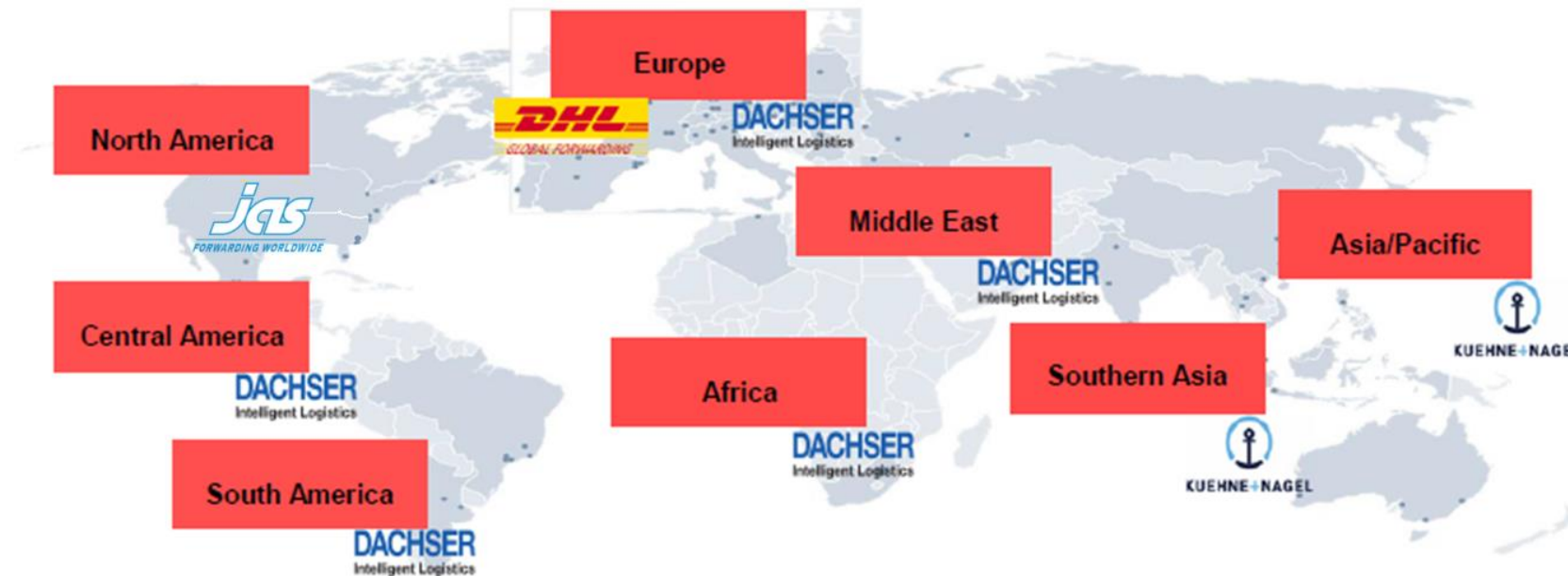
Luftfracht <2,5t weltweit

For air-freight <30kg UPS is the service provider Please note appendix 2 (CEP Forwarding Instructions) For Air Freight Shipments ≥ 2,5t is mandatory to follow BOGE GP0531