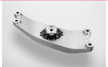
Cross Members with Transmission Mount