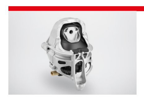
Switchable Mass Damper Engine Mounts